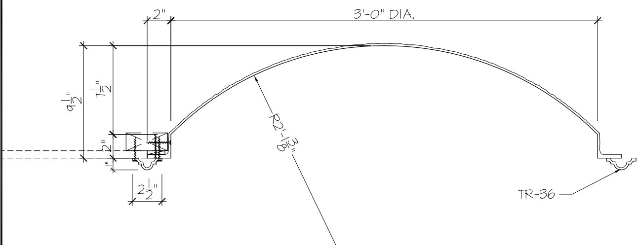
1B DETAIL SECTION SCALE : 1-1/2" = 1'-0"